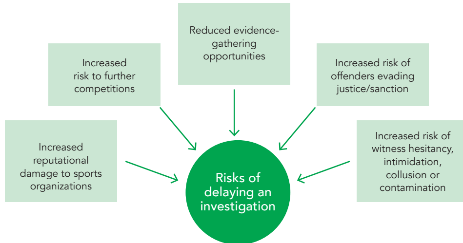
FIG. 1 TIME AND HOW IT IMPACTS AN INVESTIGATION

When an allegation, report or alert of competition manipulation is received and is deemed sufficient for the purposes of initiating a criminal or a sports investigation, or both, it is important for the credibility and success of the investigation that the response is managed in a timely fashion. If not, the deterrent effect, detection options and the potential for an effective investigation may be significantly affected.